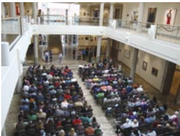
In April, the annual Elementary Art Recognition event drew young artists and their families to the Butler Institute. This awards program, held in the Butler's beautiful Beecher Court, is presented each year in conjunction with the Steel Valley Art Teachers organization.