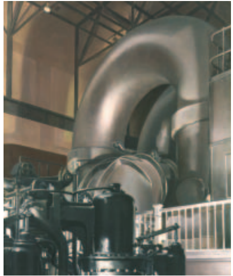
Charles Sheeler's Steam Turbine (above) will be loaned to the Des Moines Art Center (Iowa) and to the St. Louis Museum of Art (Missouri).

Butler collection images appear in many books and art catalogues, and have been seen in other Hollywood films in the past. Chuck Close's Georgia from the Institute's collection appeared in the film "Legal Eagles," and more recently, the Butler's Edward Hopper masterpiece Pennsylvania Coal Town was featured in the Sean Connery movie "Entrapment." For information about usage fees for Butler images, contact the museum's Rights and Reproductions Department 330,743.1107, ext. 116.