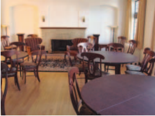
The Parlor (above) and Performance Hall (below) of Butler North have been refurbished and these facilities are both available for private events. Call 330.743.1107, ext. 122 for rental guidelines.