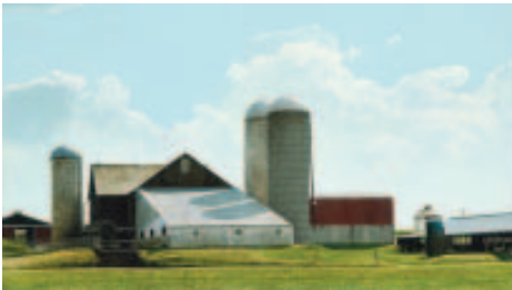
Family Farm, watercolor.

James Rosati: Sculpture (Youngstown) Renowned sculptor and teacher, James Rosati (1911-1988) created a body of work that resonates with the 20th century. These imaginative abstract structures calm rather than agitate, and are like a voice that is quiet, clear, and firm in a noisy environment. This exhibition was organized in cooperation with Peter Rose Gallery, New York City.