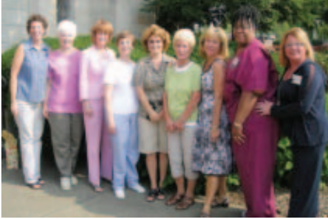
Butler 2007 Summer Arts Day Camp staff

In July, the Butler hosted its annual Summer Arts Day Camp for children ages eight through twelve. Sponsors for the event were the Abe and Leona Adler Charitable Trust, The William Swanston Charitable Foundation, The Hine Memorial Fund, First Place Bank Community Foundation, Kiwanis Club of Youngstown, Boardman Rotary Club, Warren Rotary Club, Winslow's Café, and The Daniel Lewis Educational Fund.