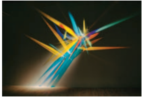
Solstice Begat , light, glass, stainless steel, 13' x 16' x 10", 2004.

A group of works of geometric abstraction on paper by a former Youngstownian will be featured in this exhibition.