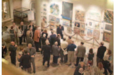
The live art auction (above left) featured works by internationally acclaimed artists. The sale of a work by painter Don Eddy (below) brought the auction to a dramatic conclusion.