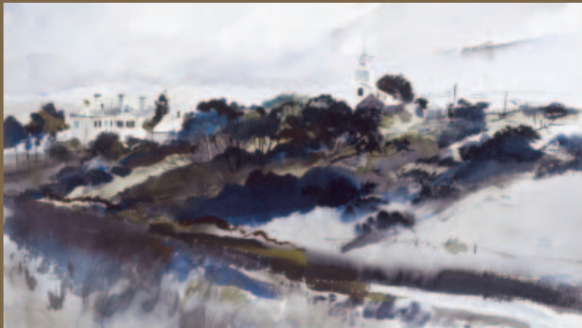
Andrew Wyeth (b. 1917), The General Knox Mansion , 1941, watercolor on paper. Museum purchase, 1942.