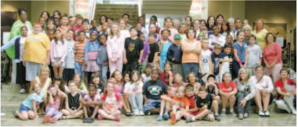
A group portrait of the Butler 2007 Summer Arts Day Camp