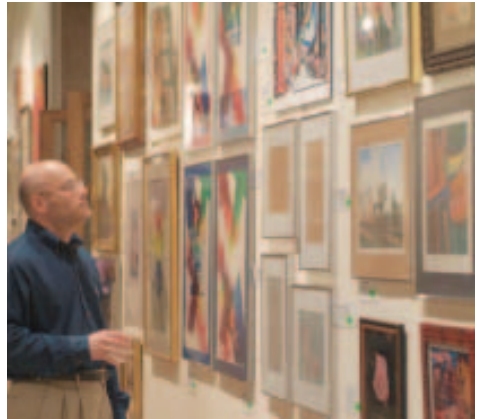
Guests (above and below) survey the 110 silent auction items donated by regional artists and other generous local contributors.

Proceeds from the very successful Great American Art Auction will provide funds to complete a new comprehensive, scholarly Butler collection catalogue, to be published in time for the Institute's 90th anniversary celebration in 2009.