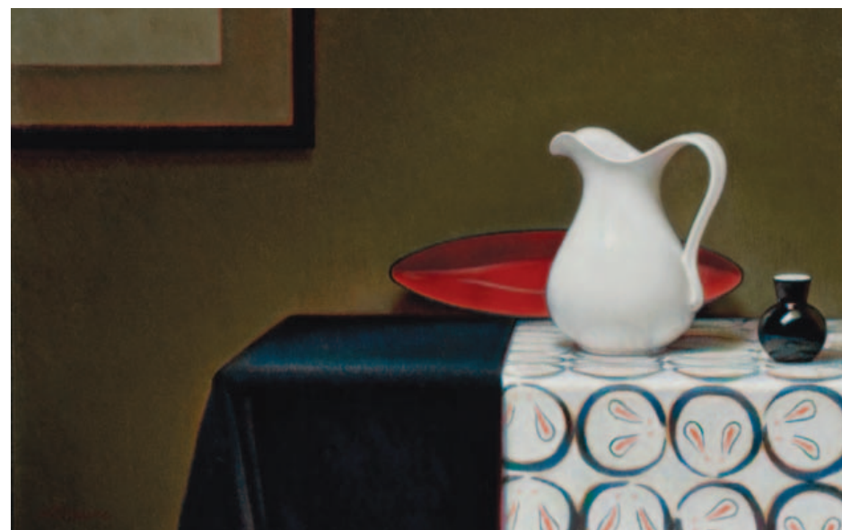
Lorraine Sack (Indianapolis, IN), Listening for Clues , oil/linen, 24 x 36 inches. Honorable Mention.