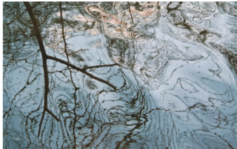
Wayne Durrill (Cincinnati, OH), Riparian Composition 7520 , digital photo, 11 x 16 inches. Honorable Mention