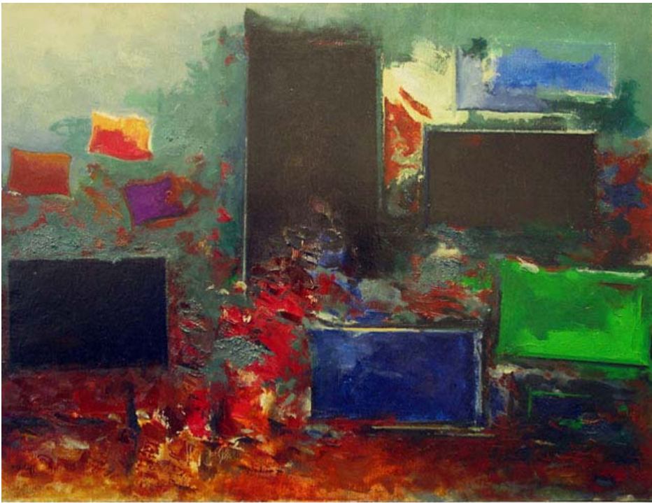
Fred Staloff (Secaucus, NJ), Nocturnal Architecture Oil 35 x 46 inches