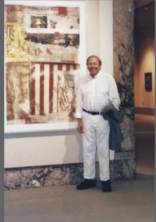
Robert Rauschenberg (seen above) visited the Butler in 1997 and posed along-side the museum's then newly acquired work "Ballot" which he created in 1997. (See page 4 of this publication.)

Remembering Robert Rauschenberg (1925-2008)