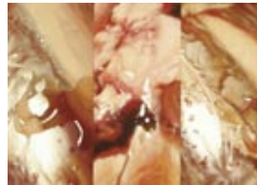
Snarge 2 , oil on canvas, 26 x 36 1/4 inches. Second Place.