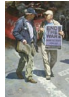
The Discussion , oil, 40 x 32 inches. Phil Desind Award.