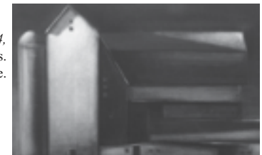
Appalachian Barn #4 , black pastel, 26 x 34 inches. Dianne B. Bernhard Prize.