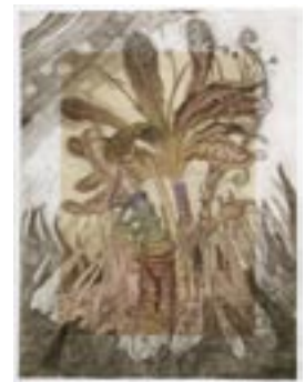
Rights of Spring , aquatint intaglio w/inkjet chine collé, 33 x 25 1/2 inches.