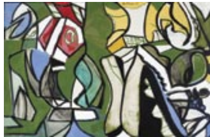
The Suitor , 1967, oil on canvas, 51 x 75 1/4 inches.