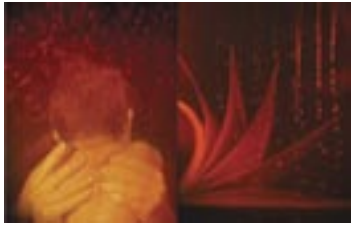
Open Book , diptych, reflection holograms, 16" x 25", 2001.