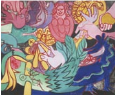
Bread Sculpture , 1977, oil on canvas, 76 1/2 x 92 inches.