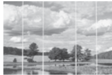
Sheepscot Village Trees , digital drawing, 30 x 47 inches. First Place.