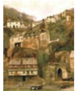
Clovelly (1895), oil on canvas, 20 X 16 inches. Butler collection, acquired 1954.