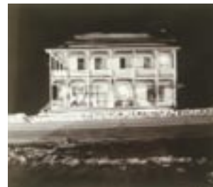
5 a.m., 10 below , photo, 34 x 31 inches. Honorable Mention.

This annual juried exhibition is open to artists over 18 years of age who reside within the United States and/or its territories. The show, which features works in all two-dimensional media, was judged this year by New York painter Don Eddy.