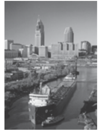
Coming up the Cuyahoga , digital inkjet print, 16 x 20 inches. Best of Show.

This annual juried exhibition is open to artists over 18 years of age who reside within the United States and/or its territories. The show, which features works in all two-dimensional media, was judged this year by New York painter Don Eddy.