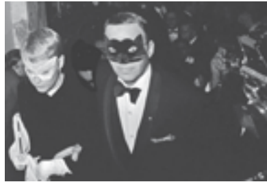
Frank and Mia at the Truman Capote Black and White Ball, The Plaza Hotel, NYC.