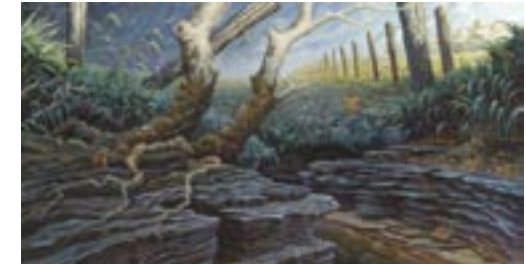
Shale and Storm , oil on canvas, 40 x 80 inches. Third Place.